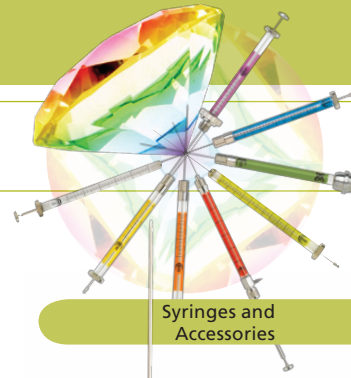
Syringes and Accessories