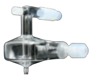
Part No. N8145120

Feature o-ring free connections to the nebulizer and torch injector, secure, leak-free threaded drain port, internal baffle and threaded auxiliary port for addition gas.