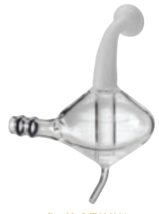
Part No. WE025221

The spray chamber is an integral part of the sample introduction system responsible for filtering the sample mist to permit the appropriate droplet size distribution to reach the plasma. The baffled cyclonic spray chamber features a central transfer tube which acts as a secondary particle separator