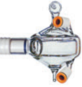
Part No. N8120180

The water-cooled design permits the introduction of coolant for temperature control. Thermostatting to constant temperature helps ensure highly reproducible results and long-term