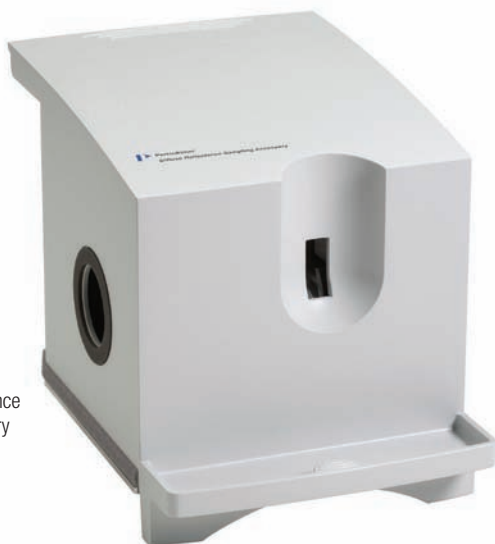
Diffuse Reflectance Accessory