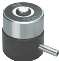
Evacuatable Potassium Bromide Die