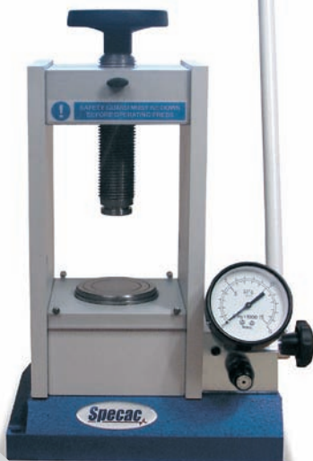
Manual Hydraulic Press