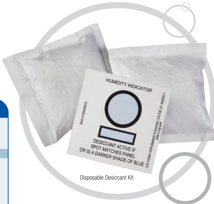
Disposable Desiccant Kit