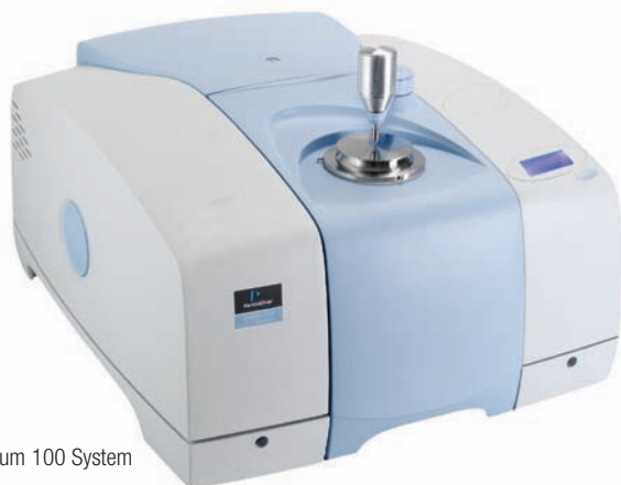
Spectrum 100 System